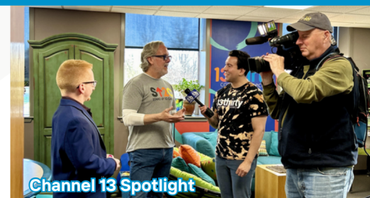
Channel 13 Spotlight