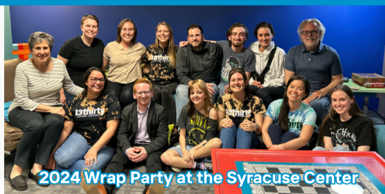
2024 Wrap Party at the Syracuse Center